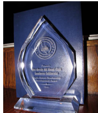
CAL 4 Wheel Drive, new member award