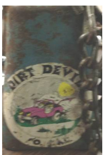
Green Old Logo